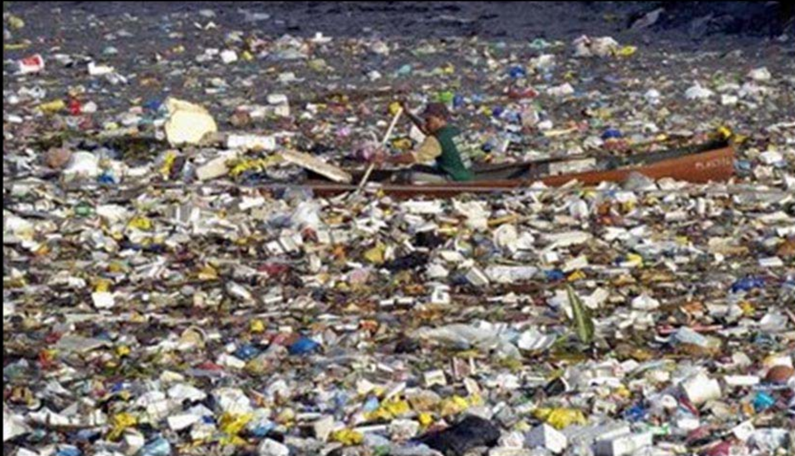
Photo of Pacific Ocean Year 2004